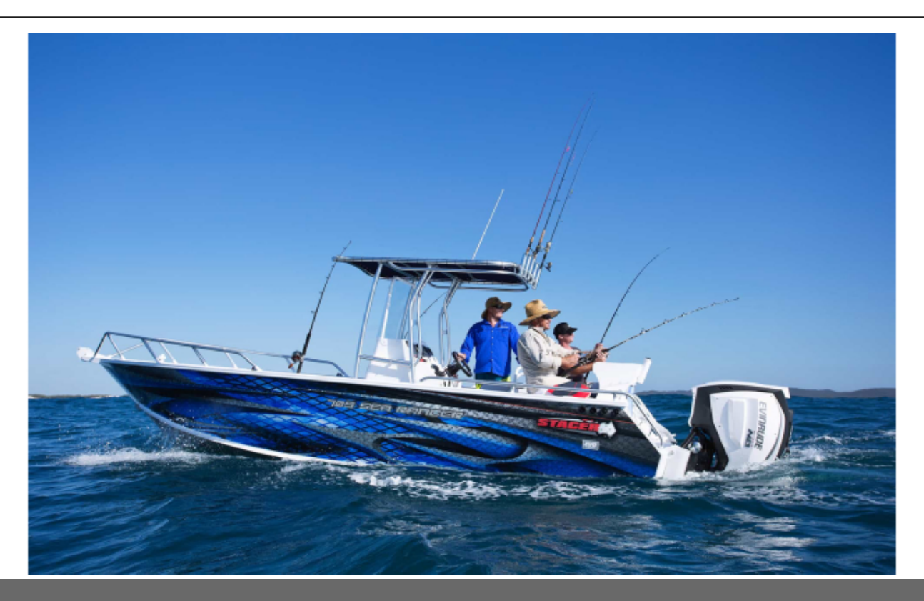
Stacer 709 Sea Ranger CC

Email: sales@crawfordmarine.com.au Website: https://www.crawfordmarine.com.au 71-77 Chickerell Street Morwell VIC 3840