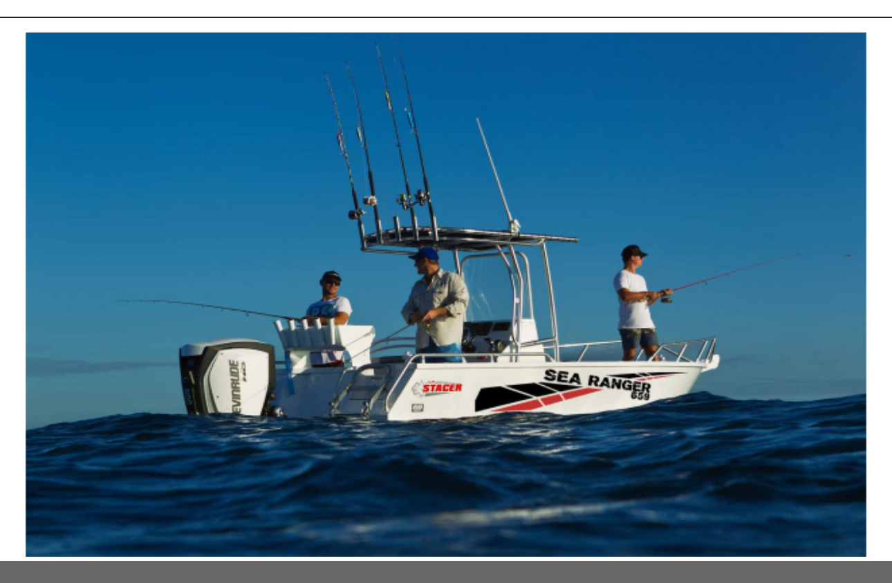
Stacer 659 Sea Ranger CC

71-77 Chickerell Street Morwell VIC 3840