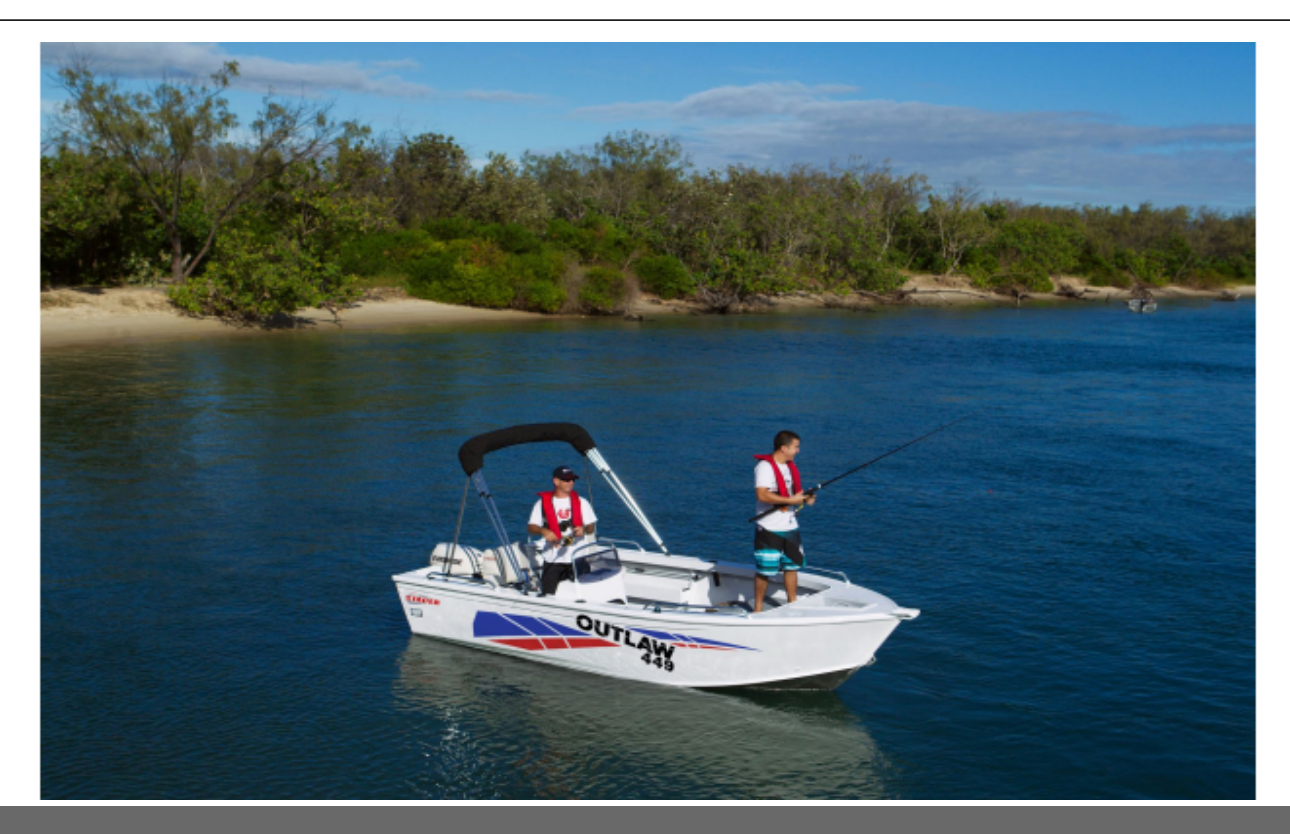
Stacer 449 Outlaw SC

Email: sales@crawfordmarine.com.au Website: https://www.crawfordmarine.com.au 71-77 Chickerell Street Morwell VIC 3840