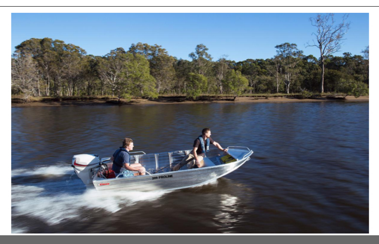
Stacer 399 Proline

71-77 Chickerell Street Morwell VIC 3840