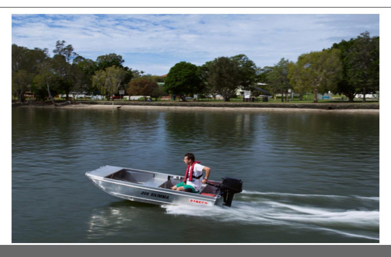
Stacer 309 Skimma

Email: sales@crawfordmarine.com.au Website: https://www.crawfordmarine.com.au 71-77 Chickerell Street Morwell VIC 3840